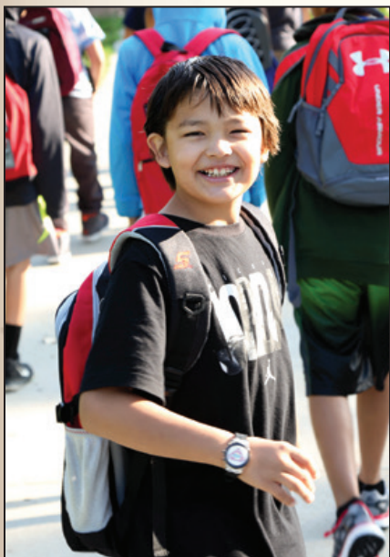
Ready to head out for the school day.

The winter and spring months bring many additional opportunities for our students including basketball, gymnastics, swimming, martial arts, wrestling, archery, dancing dolls, softball, baseball, T-ball and track and field!