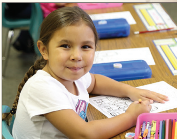
Art class is a student favorite!

Our elementary and middle school students in grades 1-8 wake up early on school mornings to get dressed and prepare for the day. Before school starts, each home says their morning prayers and eats a healthy, nutritious breakfast before grabbing their backpacks and heading to school.