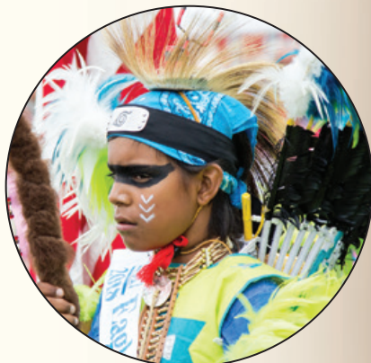
Ready for powwow!